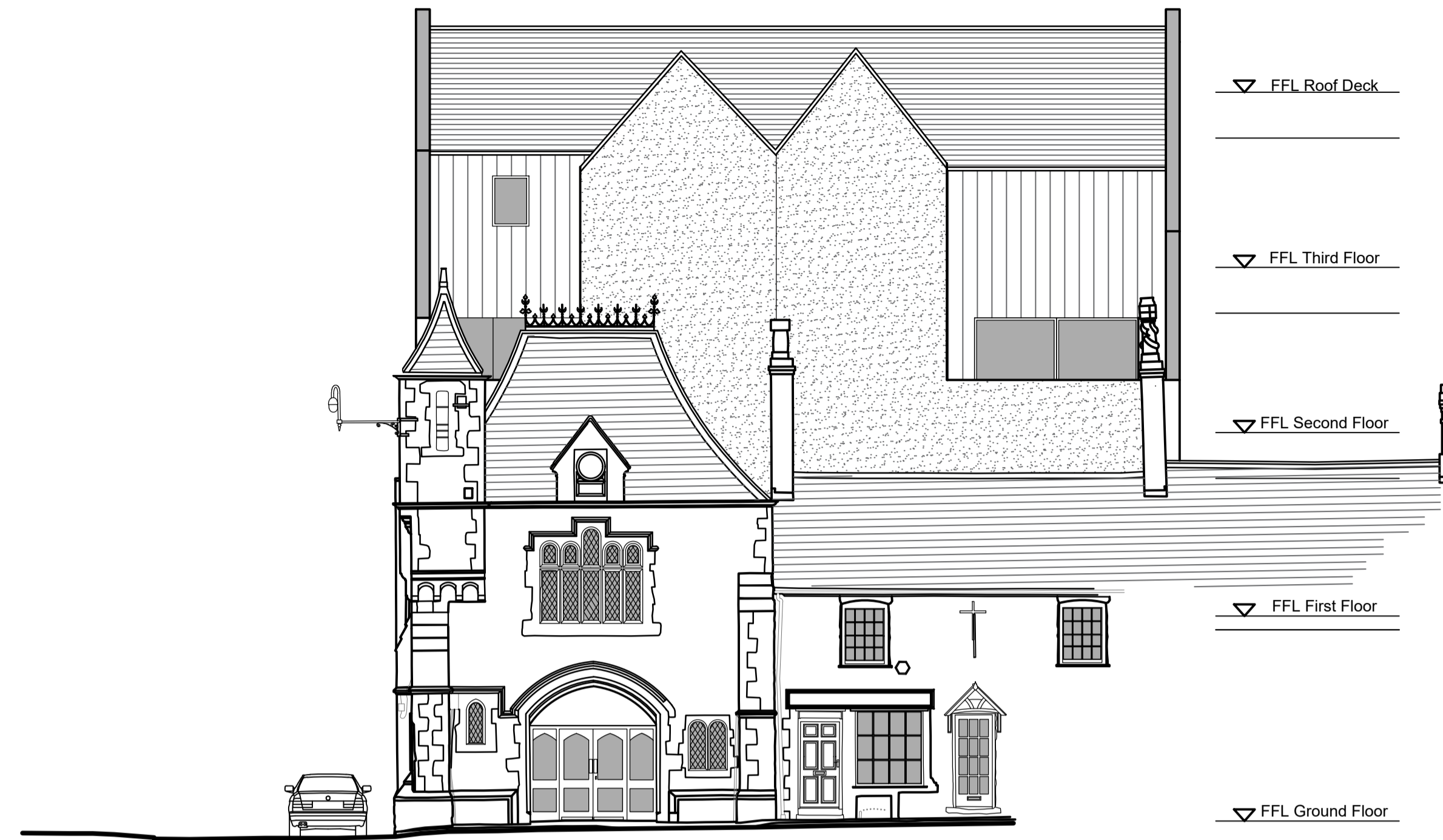
01 2200 Castle Street Elevation - As Proposed Scale 1:100 @A1