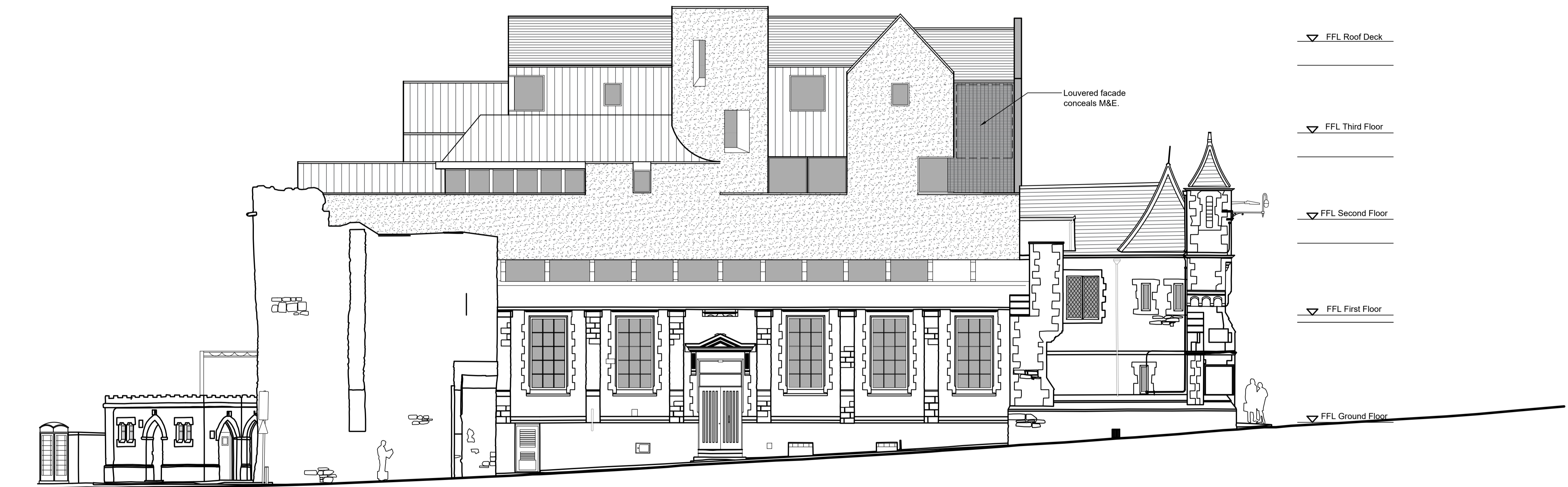
02 2200 West Elevation - As Proposed Scale 1:100 @A1